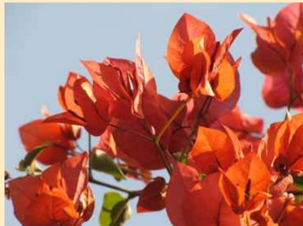
Bougainvillea in bloom at Questhaven

—Flower A. Newhouse, Meditation with a Purpose