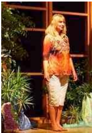
A dancer as an Angel of Prayer in a recent practice