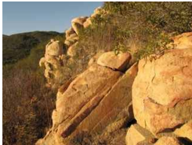
Rocks at sunset on a new Questhaven trail that was created recently by our dear friends from Switzerland.