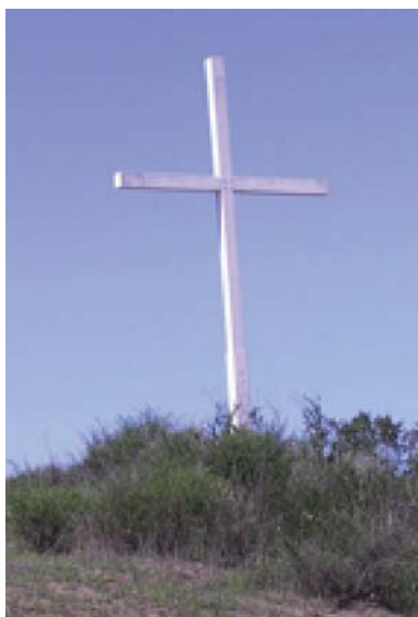
Inspiration Point at Questhaven Retreat

“The Christ Hierarchy is closer to you than you know and much more concentrated upon you and the details of your living and serving than you have ever realized.” These words from one of the Great Ones serve as a reminder of Their interest in our growth and Their desire to guide us more directly when we make the effort to be open to Them.