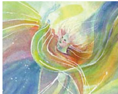
Evening Star

“We are unceasingly in the presence of Angels, wherever we are, because their mission is the well-being of life on earth.”